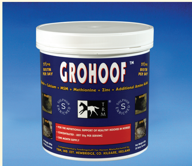
Presentation: Powder 600g

GROHOOF is the ultimate feed supplement for hooves. This new formula will nourish every tissue in the hoof horn to optimise conditions for maximum hoof growth.